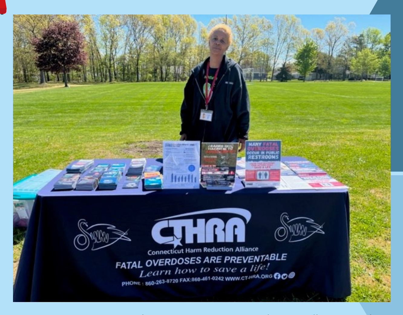
NCDHD partnering with Connecticut Harm Reduction Alliance, at the Windsor Locks Springfest, 2023.

NCDHD participates in Preparedness Region 3 and Region 4 planning and exercising activities. One of these activities is quarterly call-down drills which help to assure a fast response in the event of an emergency. Our Preparedness Coordinator is also actively tracking weather that is likely to result in significant flooding and/or power outages.